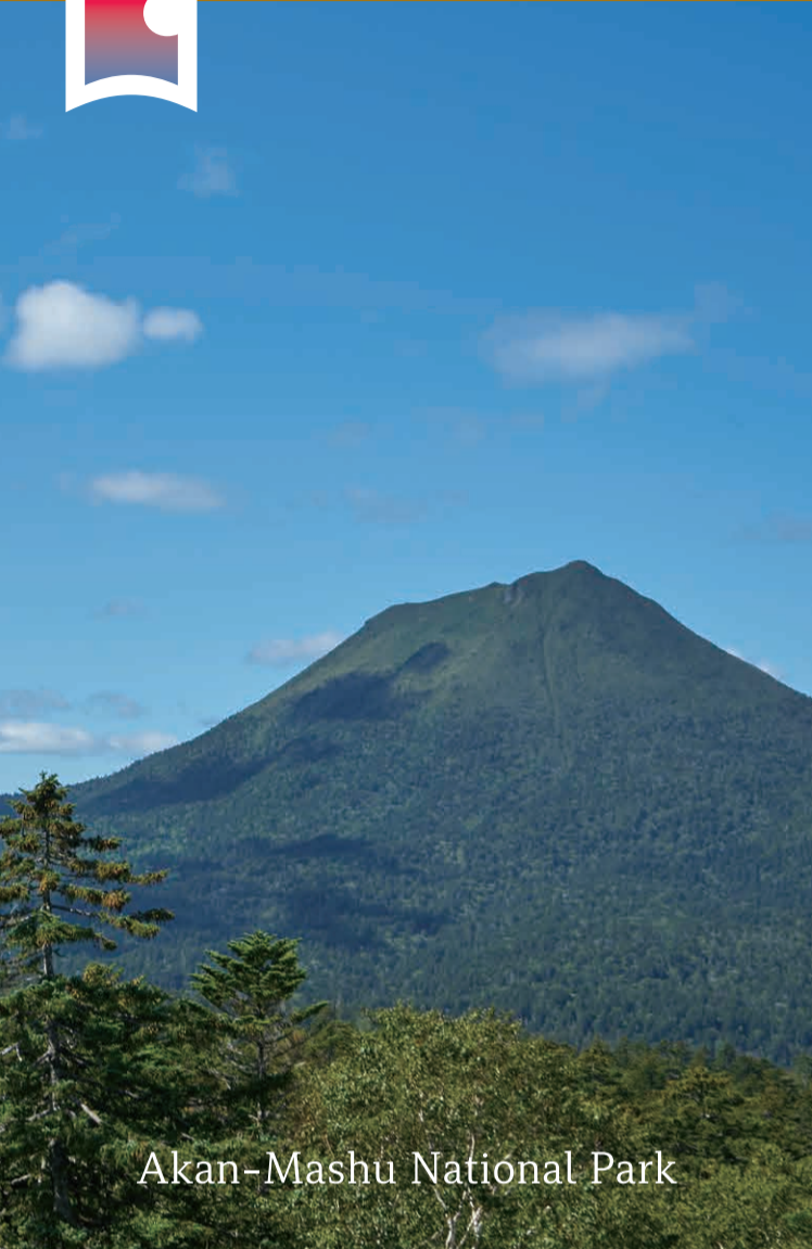
Akan-Mashu National Park