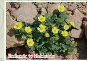
Meakan Cinquefoil Potentilla miyabei (Blooming period: June - July)