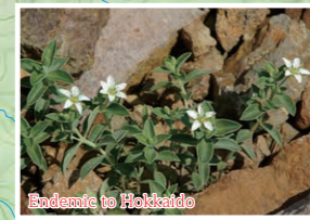
Meakan Sandwort Arenaria merckiioides (Blooming period: June - July)