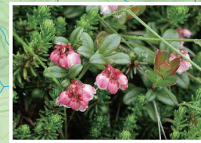
Lingonberry Vaccinium vitis-idaea (Blooming period: June - Aug.)