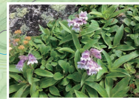
Shrubby Beardtongue Penstemon frutescens (Blooming period: June - Aug.)