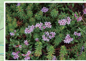
Crowberry Empetrum nigrum (Blooming period: June - July)

Lake Onneto, in the westernmost region of the Akan-Mashu National Park, is believed to have formed when an eruption from Mt. Meakan blocked the flow of the upstream section of the Rawan River. In the Ainu language, Onneto means "old, large" (onne) and "lake" (to). Known as one of Hokkaido's "Three Mysterious Lakes", on sunny days the lake appears as a mixture of cobalt blue and emerald green.