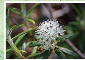
Milky Way Rhododendron Rhododendron diversipilosum (Blooming period: June - July)